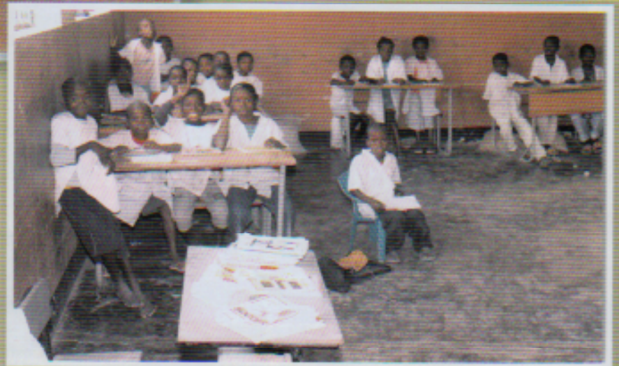
COBALA - SCHOOL FOR RETURNING REFUGEES