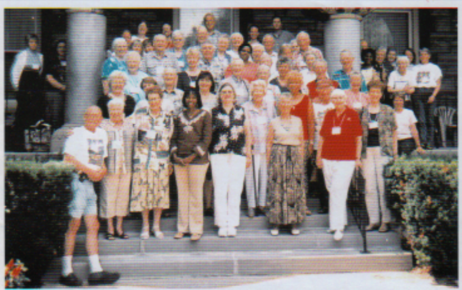
Officers Members (9 new) Regional Reps.